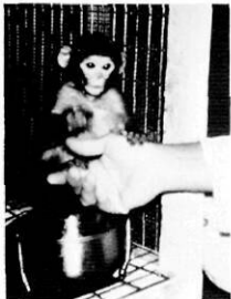
Fig. 1. "Swinging" surrogate reared monkey freely interacts with human attendant.