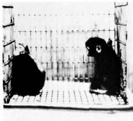
Fig. 3. Two 8 month old isolate reared monkeys who avoid touching and social interaction.