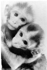
Fig. 4. Two normally reared monkeys touch and cuddle one another.