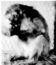
Fig. 5. Self-biting and self-mutilation of an adult isolation reared rhesus.