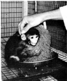
Fig. 2. "Stationary" surrogate reared monkey avoids interacting with human attendant.